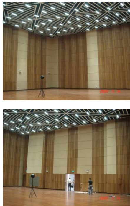
Figure 3 Photo of the main rehearsal room

According to above materials and constructions, we can calculate out the occupied reverberation time at medium frequency bands for the main room is 1.7s, 2.2s at 125Hz, 2.0s at 250Hz, 1.4s at 2kHz and 1.2s at 4kHz. As to the another room, the RT value for occupied situation at medium frequency bands is 1.2s, 1.5s at 125Hz, 1.3s at 250Hz, 1.1s at 2kHz and 0.9s at 4kHz. These data are agreeable to the designed data. Figure 3 shows the innerview of main rehearsal room.