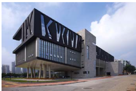
Figure1 Outer view of the rehearsal room building

The acoustical design work was taken by our laboratory. The tasks include sound insulation design, noise control and acoustics design. After its completion, an acoustical measurement was also taken. The measurement results show that the acoustical data met the designing object well. The musicians of Guangdong Xinghai Orchestra highly appreciate the acoustics of these two rooms and these halls are assessed as best rehearsal halls in China.